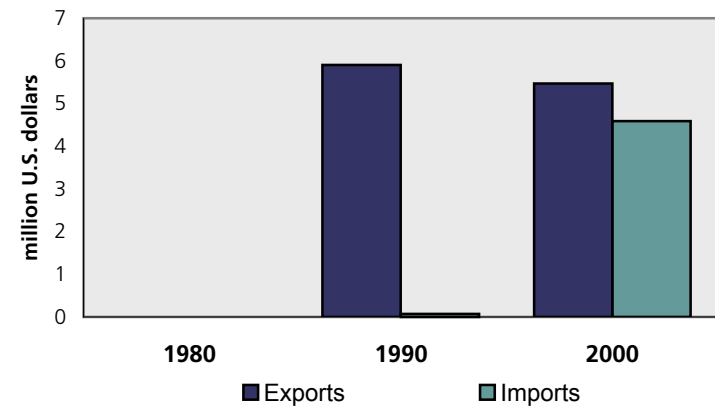
Trade in Fish and Fisheries Products, Albania, 1980-2000

View more Country Profiles on-line at http://earthtrends.wri.org