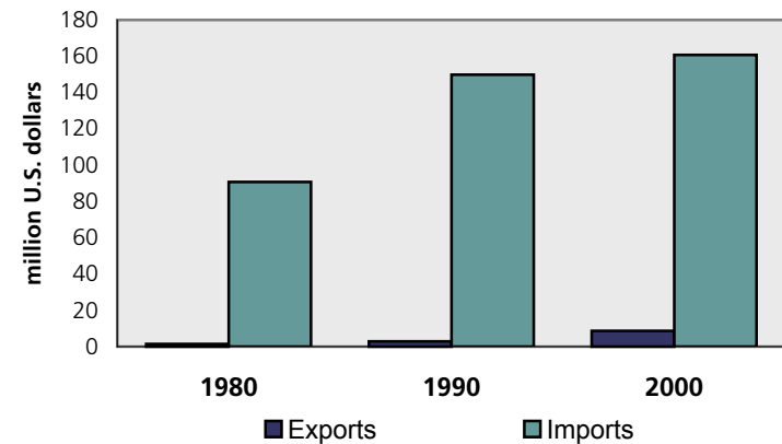
Trade in Fish and Fisheries Products, Austria, 1980-2000

View more Country Profiles on-line at http://earthtrends.wri.org