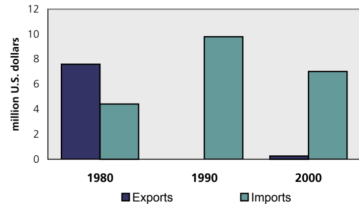
Trade in Fish and Fisheries Products, Bermuda, 1980-2000

View more Country Profiles on-line at http://earthtrends.wri.org