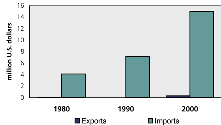
Trade in Fish and Fisheries Products, Brunei Darussalam, 1980-2000

View more Country Profiles on-line at http://earthtrends.wri.org