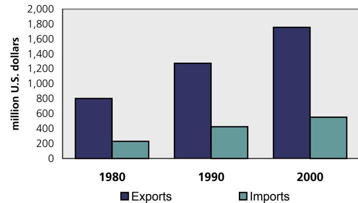
Trade in Fish and Fisheries Products, Taiwan, Province of China, 1980-2000

View more Country Profiles on-line at http://earthtrends.wri.org