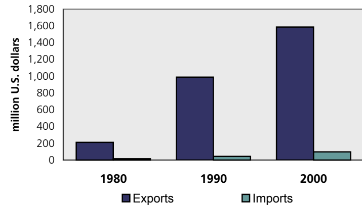
Trade in Fish and Fisheries Products, Indonesia, 1980-2000

View more Country Profiles on-line at http://earthtrends.wri.org