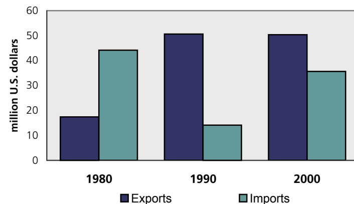
Trade in Fish and Fisheries Products, Islamic Republic of Iran, 1980-2000

View more Country Profiles on-line at http://earthtrends.wri.org