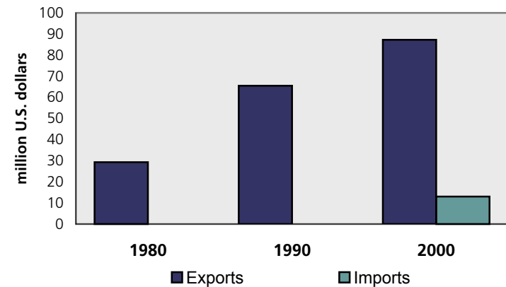
Trade in Fish and Fisheries Products, North Korea, 1980-2000

View more Country Profiles on-line at http://earthtrends.wri.org