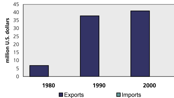
Trade in Fish and Fisheries Products, Maldives, 1980-2000

View more Country Profiles on-line at http://earthtrends.wri.org