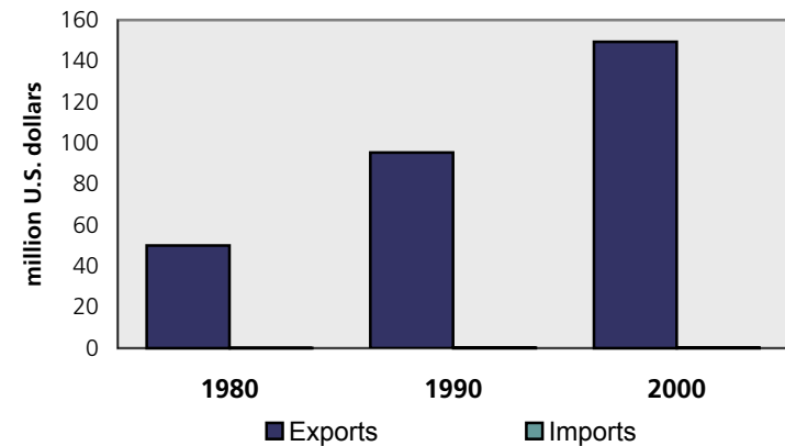
Trade in Fish and Fisheries Products, Pakistan, 1980-2000