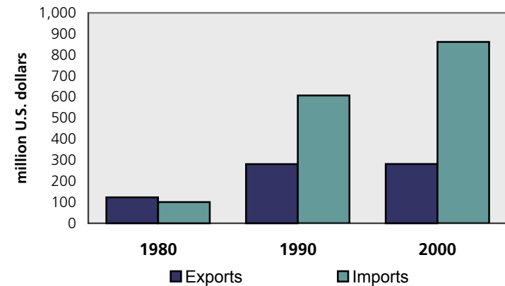
Trade in Fish and Fisheries Products, Portugal, 1980-2000

View more Country Profiles on-line at http://earthtrends.wri.org