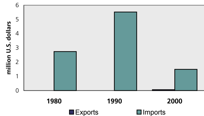
Trade in Fish and Fisheries Products, Burkina Faso, 1980-2000

View more Country Profiles on-line at http://earthtrends.wri.org